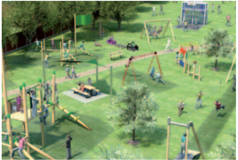
An artist's impression of what the play area could look like