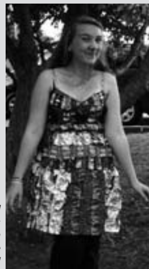
Pictured: Holly had to eat lots of sweets to get enough wrappers to make this dress!

Students wowed the audience further by modelling Prom dresses from The Frockshop in Stow and some of Redditch Design Studio’s amazing hats, straight from the 2011 Birmingham Clothes Show. Students also modelled a range of outfits from the Design Studio based on Vivien Westwood designs, in what proved to be a fun and memorable evening.