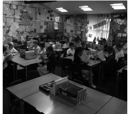
Year 5 pupils at Ettington School look up words in their dictionaries